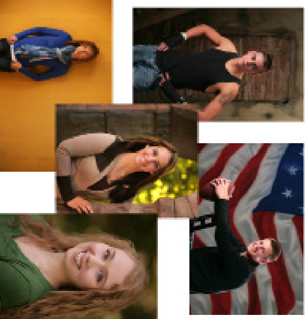
SENIOR PORTRAITS by REALife PHOTOgraphy - THE Tri-Cities FINEST

REALife PHOTOgraphy 37007 S. Oak Street Kennewick, WA 99337 509.582.3338 - Fax 509.582.3338