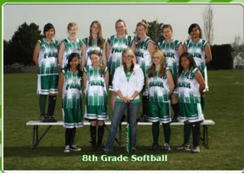
8th Grade Softball